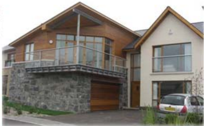
Beautiful Beach front home