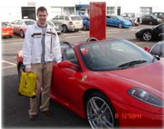
A stunning Ferrari Convertible