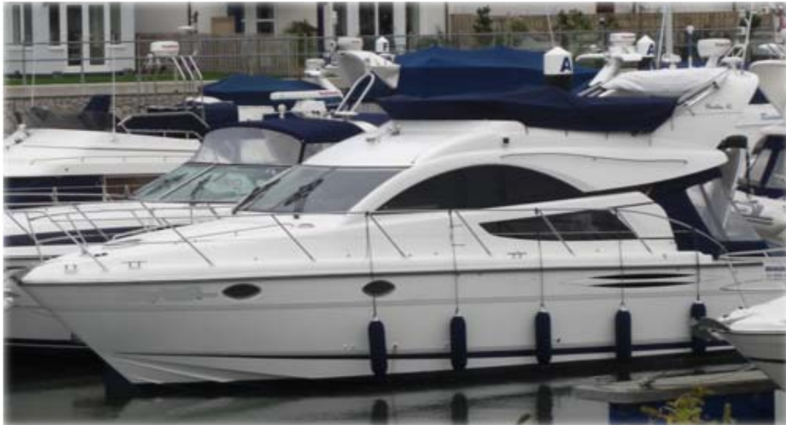
Where I consider my "Internet Office"

Now believe me... I certainly didn't achieve this over night.